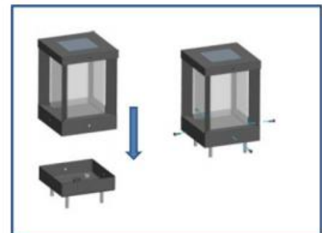
Step 3 : Place the lantern on the base and lock it by 4 supplied screws.