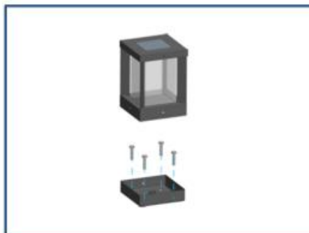
Step 2: Remove the base from the lantern and Mounted the base onto the deck / ground with screws (supplied).