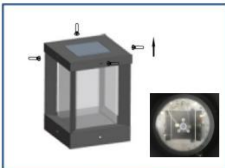
Step 1 : Remove the top cover from the lantern by unscrewing the 4 screws and Press the button to active the light.