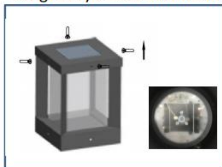
Step 1 : Remove the top cover from the lantern by unscrewing the 4 screws and Press the button to active the light.