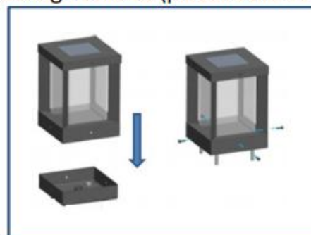
Step 2: Place the lantern on the base and lock it by 4 supplied screws.